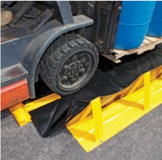
Sides easily fold down to allow pallet jacks and forklifts to be driven into and out of containment.

May help comply with containment regulations.