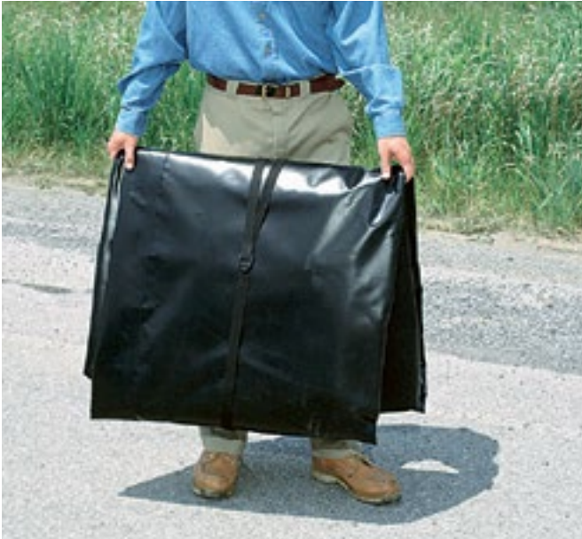
Folds to a size that's easy to handle, carry and store.