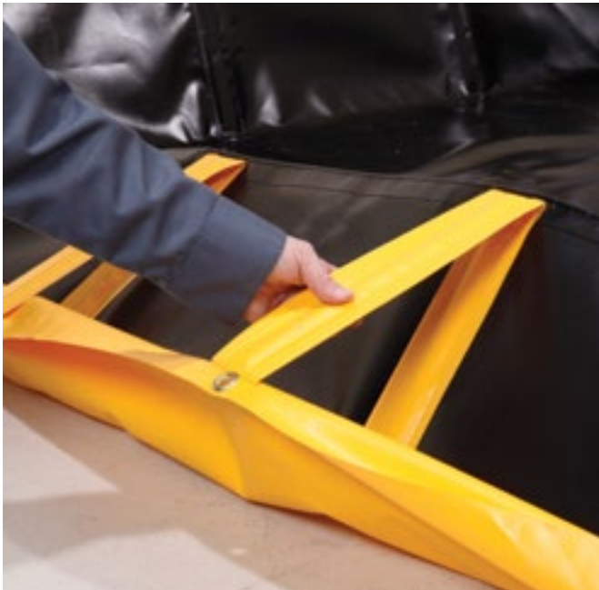
Quick setup! Just pull out one support and the entire wall takes shape.